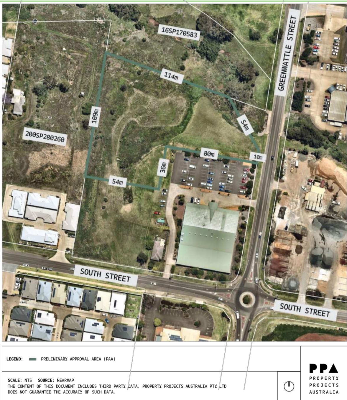
Figure 1 – Preliminary Approval Area